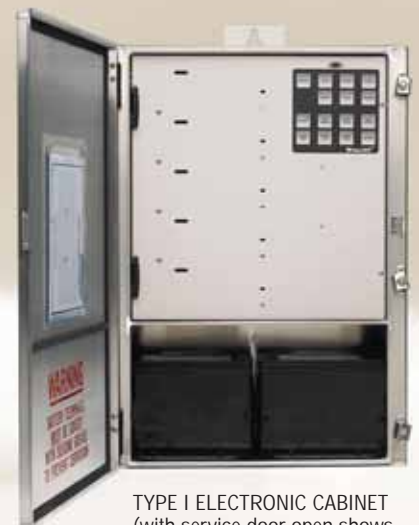
TYPE I ELECTRONIC CABINET (with service door open shows control panel and battery tray with optional batteries).