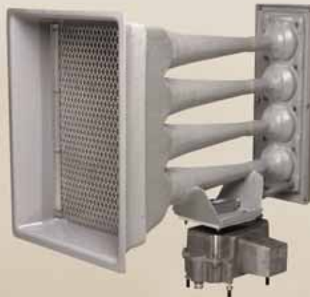
VORTEXR4 cell speaker housing mounted on rotor.

Other features are dependant upon one or two-way controls. Whelen equipment can be interfaced with many different types of two-way radio communications products and systems including 800Mhz trunking, Motorola's MOSCAD, FSK, Narrow-Band and VHF Low Band. The following is available as standard options. Contact factory for special applications.