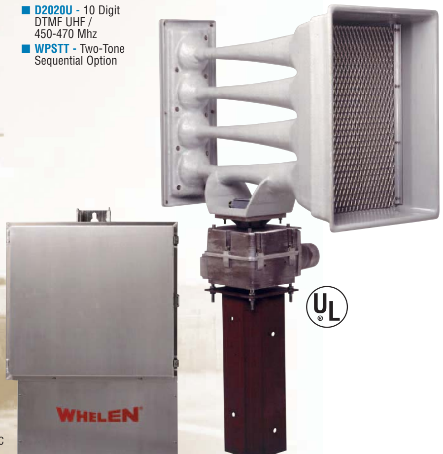
TYPE II ELECTRONIC CABINET