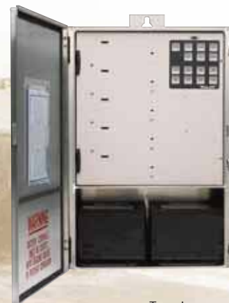
Type I Electronic Cabinet